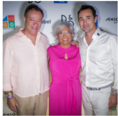
Photo above: My Yacht Group event aboard super-yacht Gene Machine; Gene Chaser, Miami.