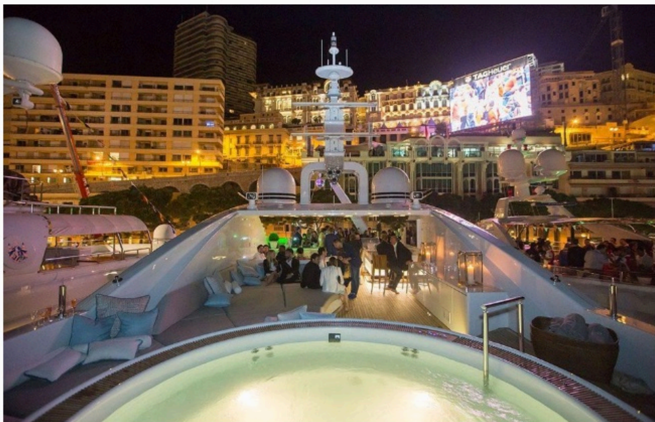
The hottest parties during the Monaco Grand Prix are always on the yachts. MY YACHT GROUP

Hotels like the Fairmont Monte Carlo (overlooking the most famous hairpin turn in Formula 1) and others are booked solid well in advance so guests can be as close as possible to the action. And watching from temporary grandstands that get erected on the course is another way to see the race. But for many, the best way to experience the Monaco Grand Prix will always be from the deck of a yacht (like the following that are available for charter from Burgess Yachts ) that are moored just behind the temporary safety fence next to the course.