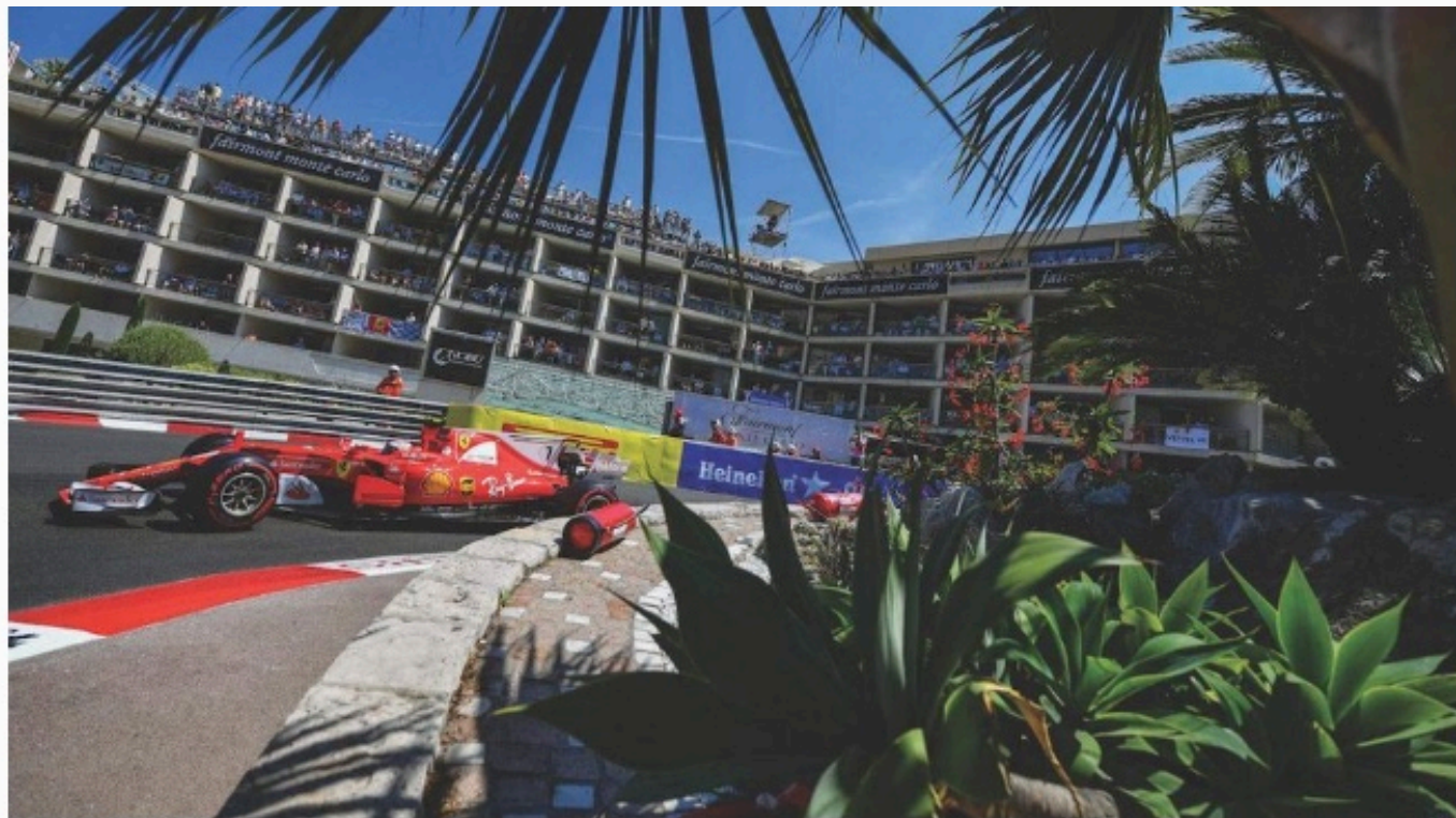
The Fairmont Hairpin. FAIRMONT MONTE CARLO

As you'd expect, the principality pulls out all the stops when this iconic race is happening. An invite to The Yacht Club De Monaco (located on the harborside AND in front of Monaco's famous tunnel where movie stars mix with drivers) is one of the hottest tickets in town.