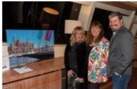
Team YachtAid Global