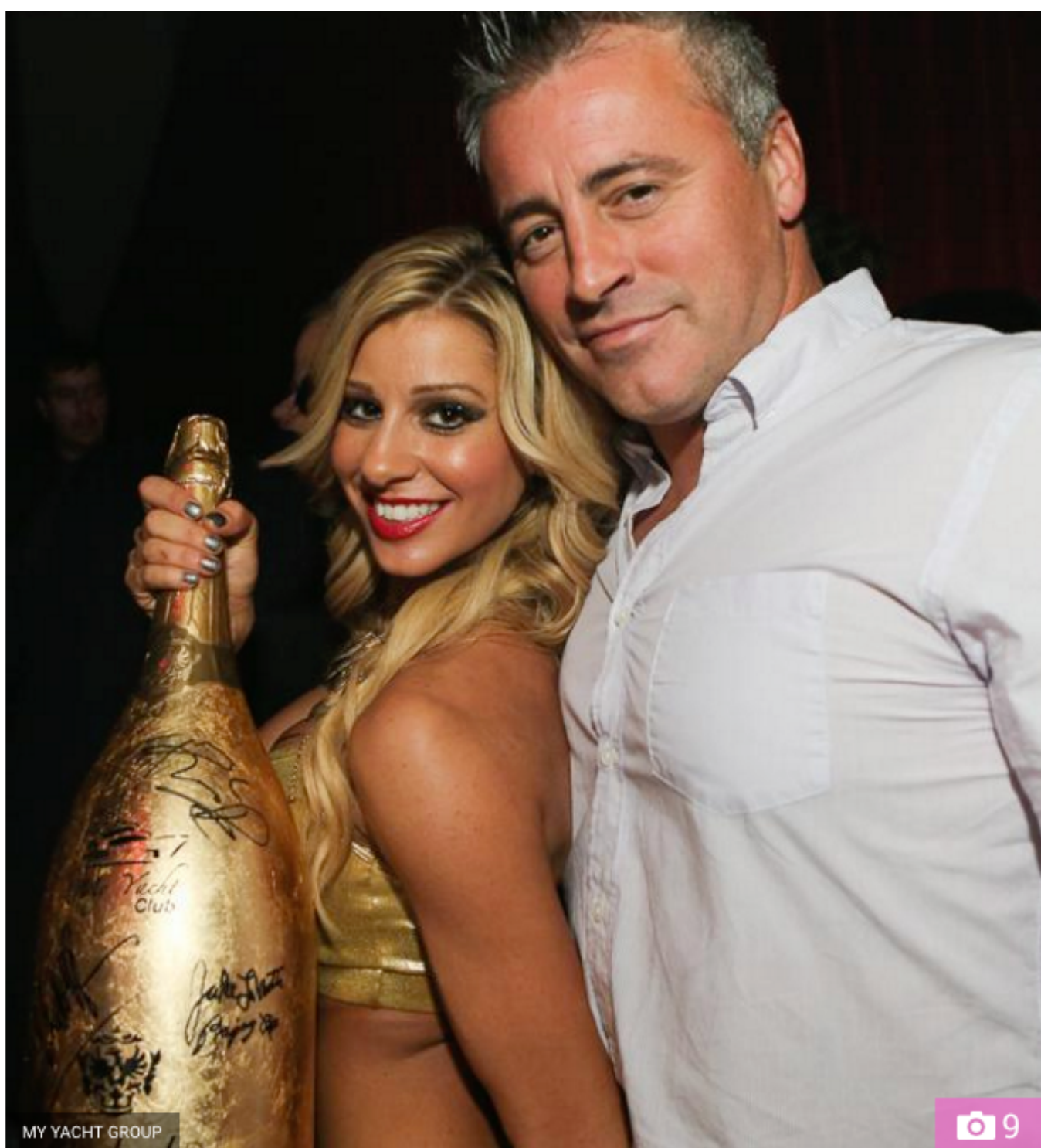
Matt LeBlanc with a female companion and a large bottle of champagne at one of Nicholas's parties