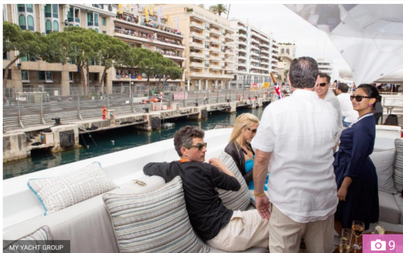
The view of the Monaco race track from the luxury yacht