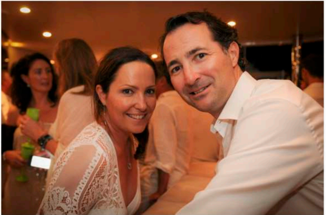
My Yacht Group