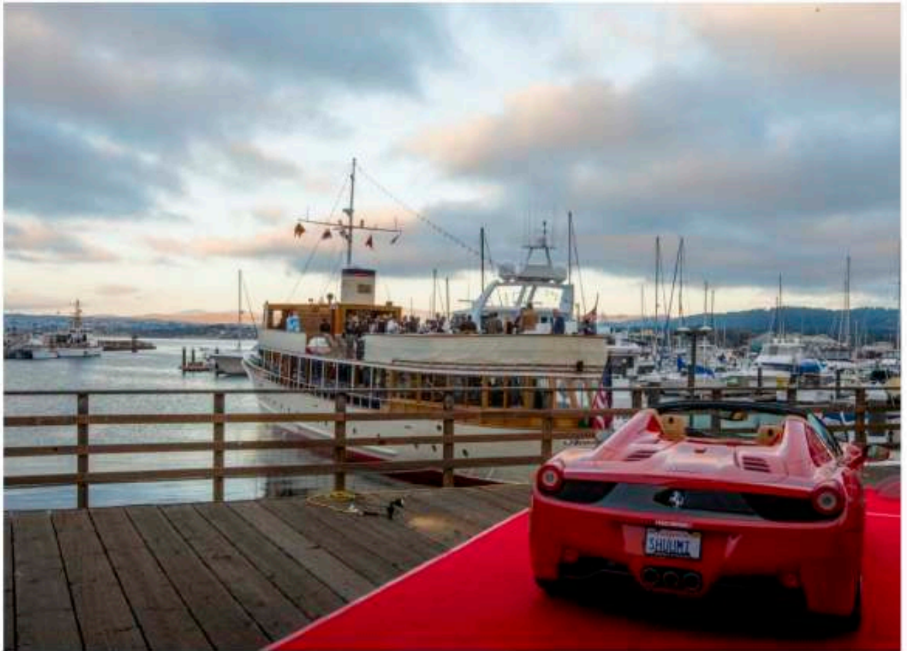
My Yacht Group