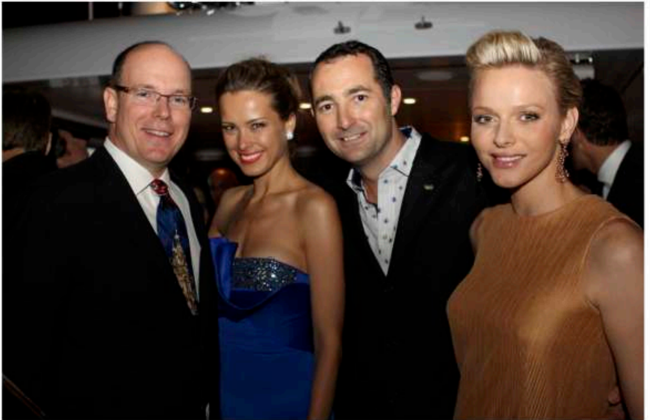
My Yacht Group