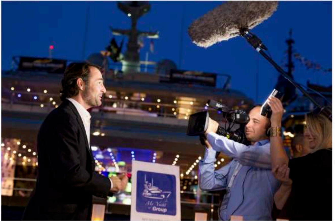
My Yacht Group