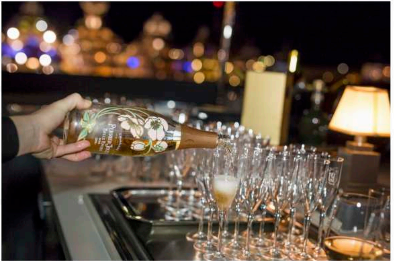
My Yacht Group

There is no expense spared. 'Everything is six star,' says Frankl. 'We drink Perrier-Jouët Belle Epoque vintage rosé champagne which costs €300 (£257) a bottle, and we will go through 100 bottles pretty easily.'