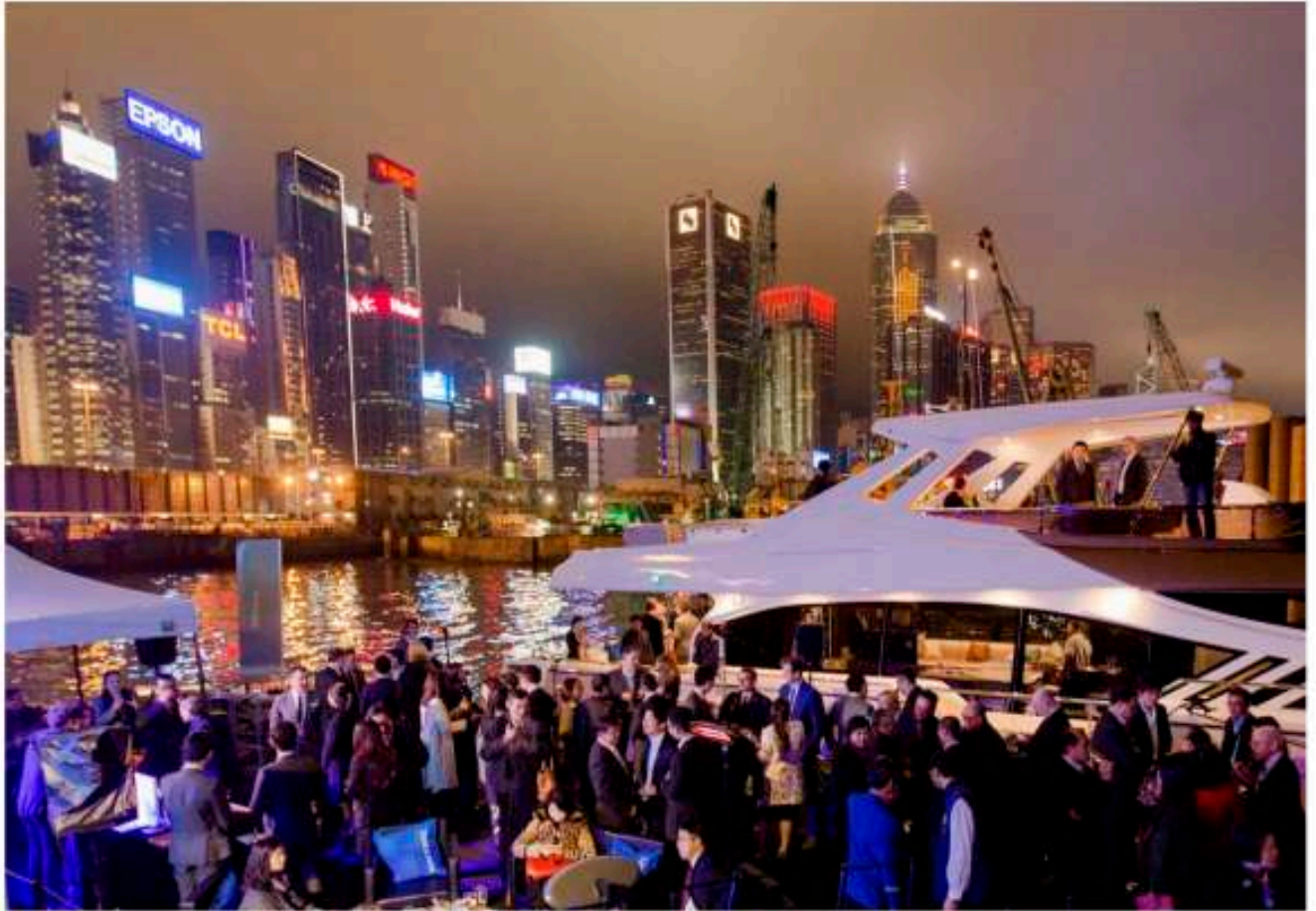
My Yacht Group

The parties keep him busy. There are usually around 120 guests at the parties with a combined net worth of approximately $75 to $100 (£58 to £77) billion.