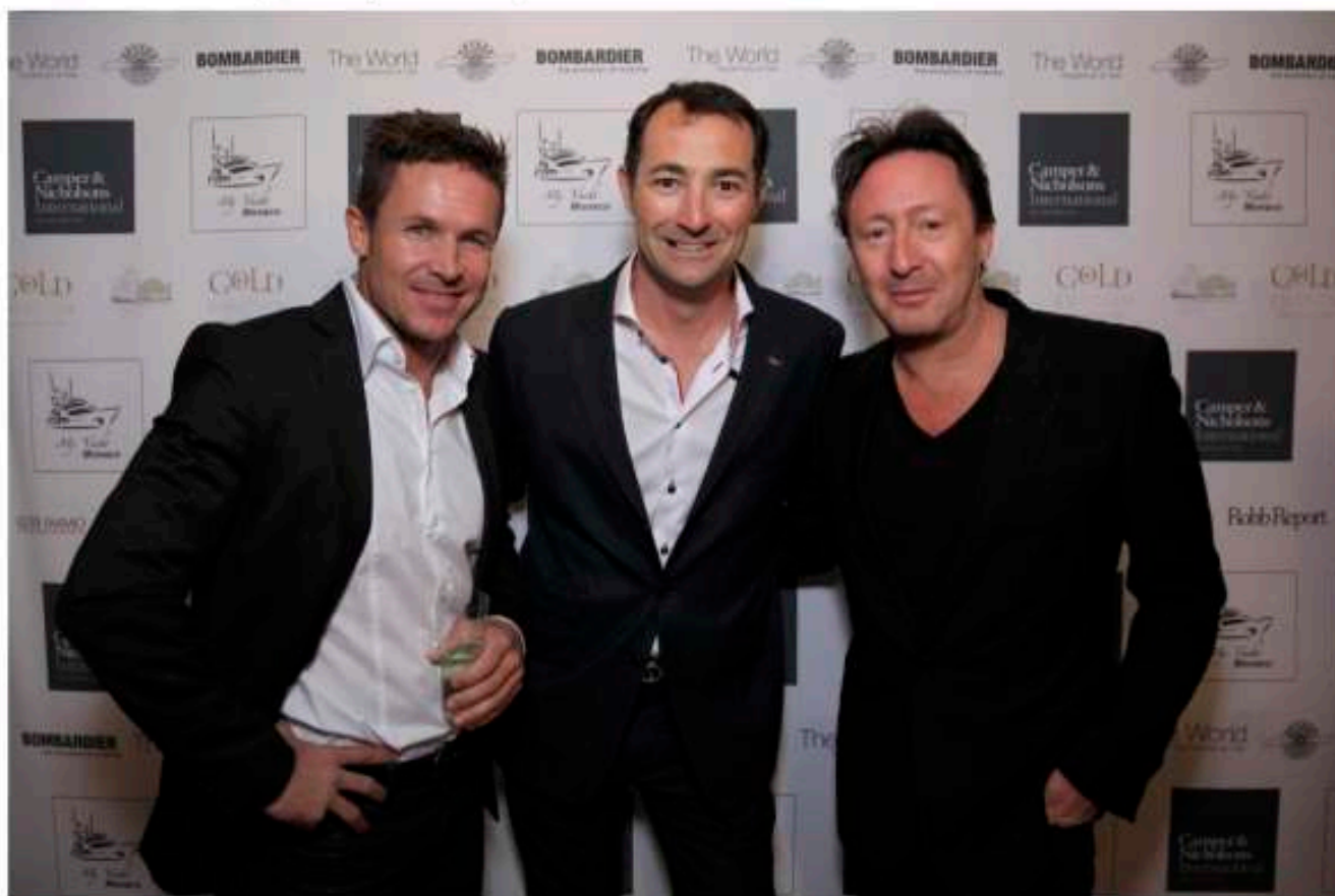
My Yacht Group

As well as royalty, you can expect the likes of other celebrity guests, such as Austrian daredevil Felix Baumgartner and Julian Lennon, son of John Lennon (both pictured).