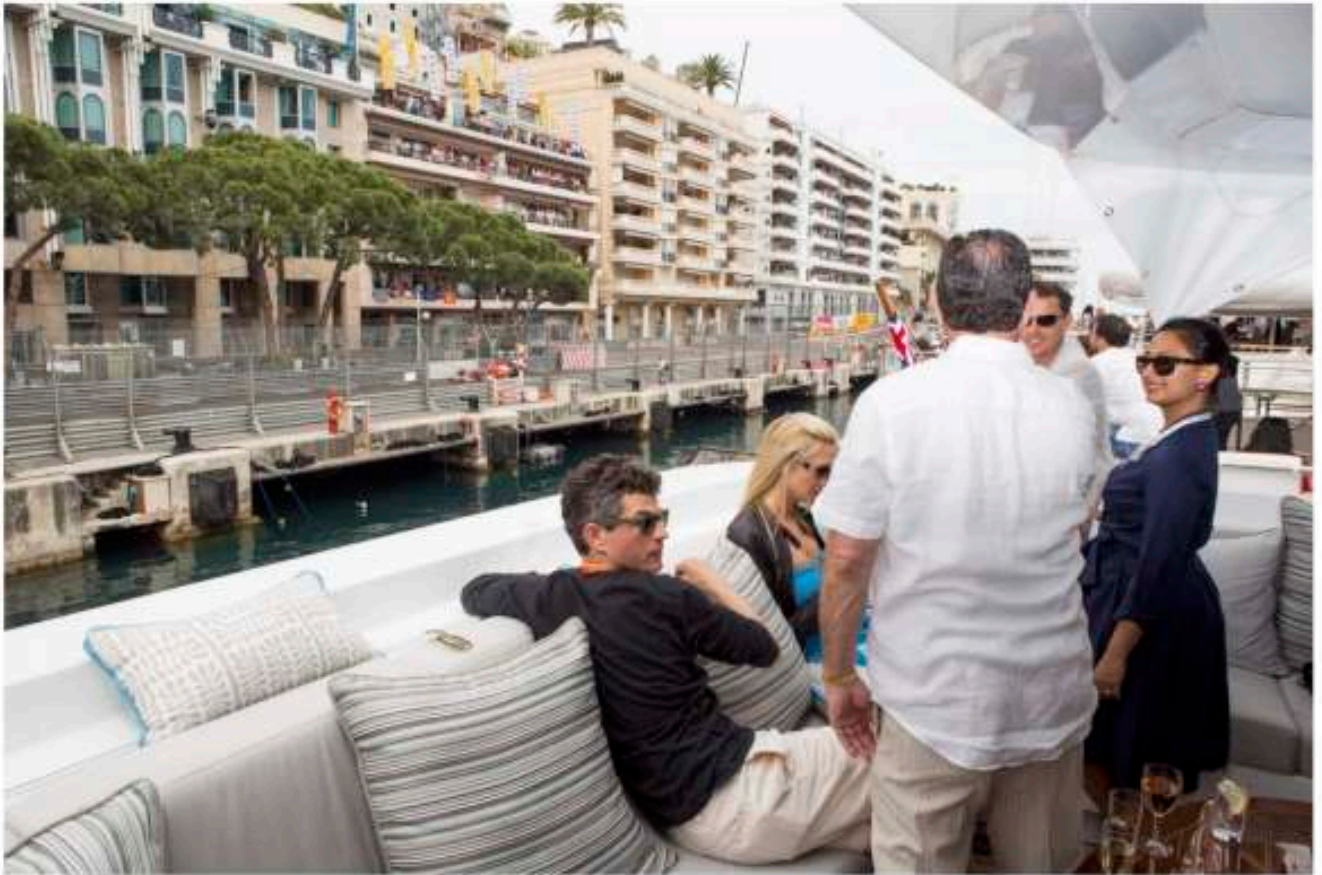
My Yacht Group